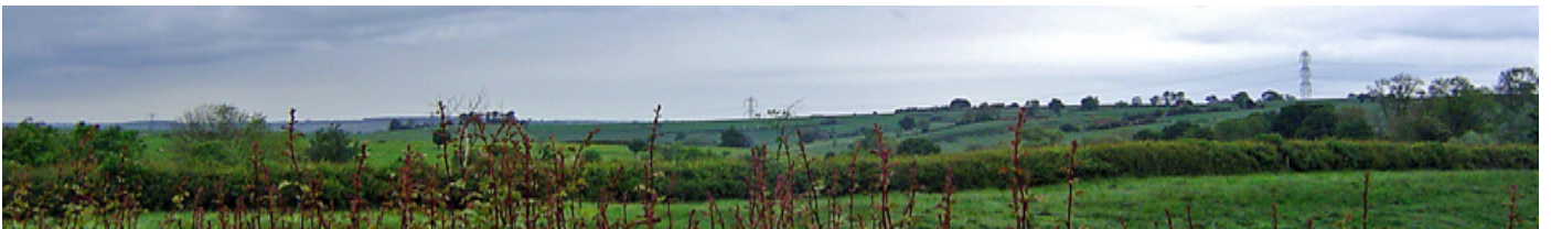
View from School Road towards the Nene Valley